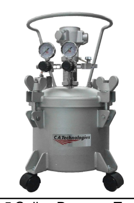
2.5 Gallon Pressure Tank With Air Powered Agitation 51-203 Single Regulated 51-204 Double Regulated